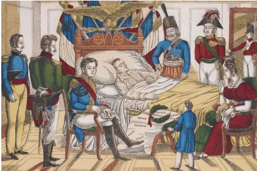
Napoleon's Death Bed

Sydney Gazette Saturday 24 December 1814