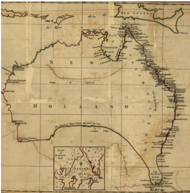
Cooks map of the east coast of New Holland

We all became Australians on the same day, Australia Day!