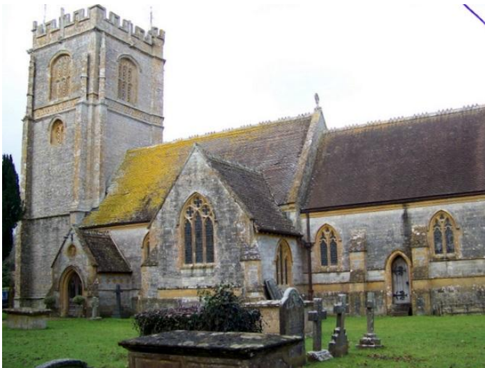
Church of St James Chilton Cantelo