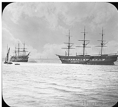
Training ship Shaftsbury